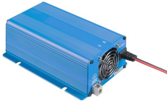
Phoenix Inverter 12/180