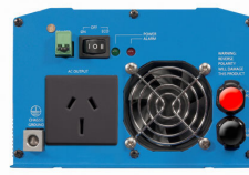
Phoenix Inverter 12/800 with AN/NZS 3112 socket