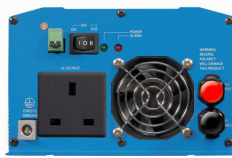
Phoenix Inverter 12/800 with BS 1363 socket