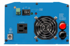
Phoenix Inverter 12/800 with Nema 5-15R socket