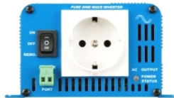
Phoenix Inverter 12/180 with Schuko socket