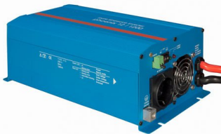
Phoenix Inverter 12/800 with Schuko socket

For our lower power models we recommend the use of our Filax Automatic Transfer Switch. The Filax features a very short switchover time (less than 20 milliseconds) so that computers and other electronic equipment will continue to operate without disruption.